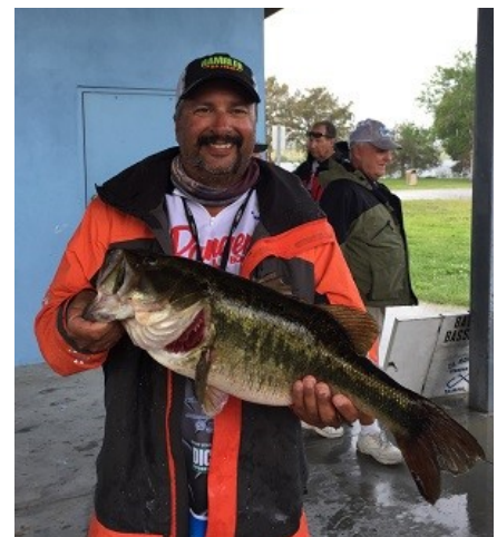
Sunday's big fish