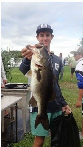
Saturday's big fish