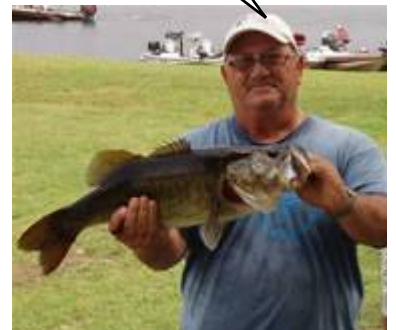
Big Fish 7.04lbs

I got the big one! I got the big one! I got the big one! I got the big one!